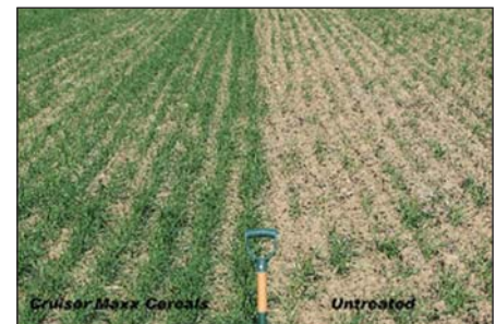
Cruiser Maxx Cereals provides stronger emergence, even under stressful conditions.

This vigor effect is evident even when disease or insect pressure is below economic thresholds in the field. It means that when growers use Cruiser Maxx Cereals, they'll see stronger, healthier, more vigorous crops and higher yields.