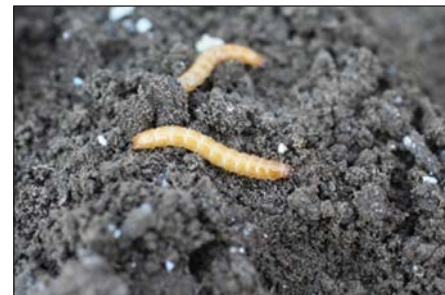
Cruiser Maxx Cereals provides effective protection against wireworms.

And don't forget that Cruiser Maxx Cereals is also eligible for many Syngenta offers, including the Partner Program™, our 3-Year Equipment Upgrade Program, the Premium Power Pack Grower Offer, and more. Talk to your Syngenta Seed Care Specialist to learn how.